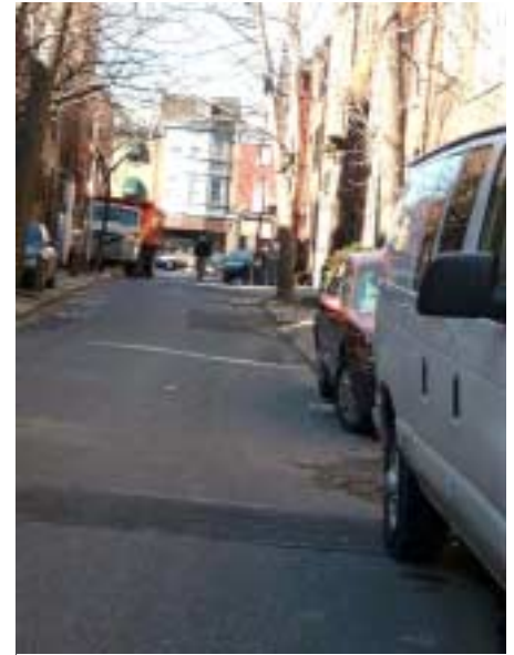
Cars block the sidewalk in the Rittenhouse Square area of Center City.

Since the law's adoption, our attempts to get a handle on PPA's enforcement strategy have fallen on deaf ears. Current PPA policy allows for twenty minutes on the sidewalk if two wheels of the vehicle remain on the